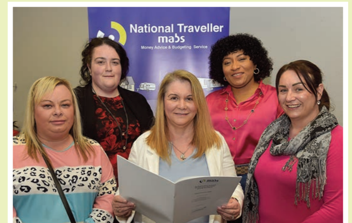
Insurance launch pics/National Traveller MABS staff at Insurance Research Launch