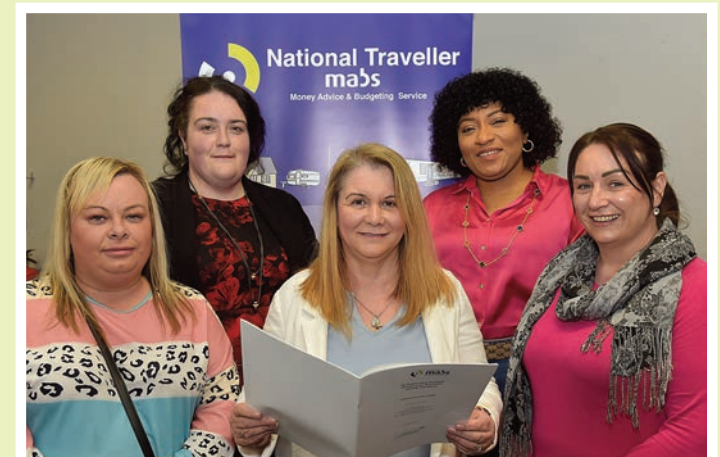
Insurance launch pics/National Traveller MABS staff at Insurance Research Launch